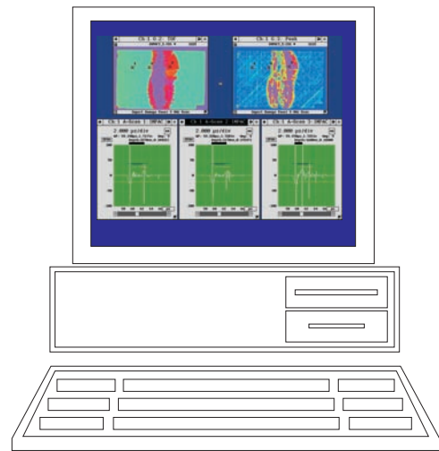
Data Acquisition System